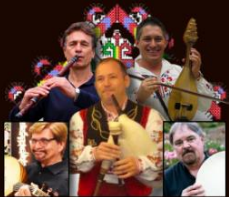
Veseljatsi "The Revelers"