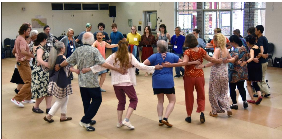
Zoriuszka, showing the special back basket hold in Fig I.

Sequence: The dance is done once as described above.