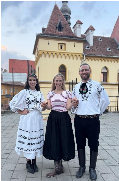
The author with hosts in Saxon.

International Dance Arts Collective (IDAC) will be presenting their Fall 2025 “Festivals of Light” concert Friday, November 7 at 7 pm and Saturday, November 8 at 2 pm. The venue in the Sacramento area is being finalized and will be announced in mid-October.