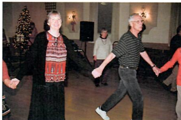
A VERY nice smile at the Snap-Y Dancers Holiday party

©Let's Dance! (ISSN#0024-1253) is published monthly by the Folk Dance Federation of California, Inc., with the exception of the May-June and July-August issues, which are released each two month period. Standard mail postage paid at Sacramento, California.