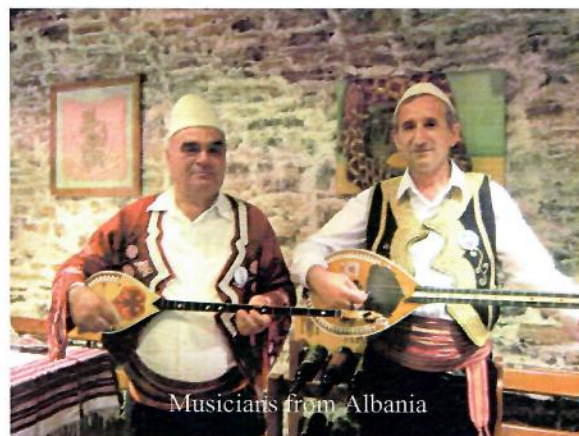
Musicians from Albania