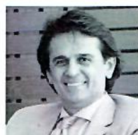
Ercüment Kiliç Turkey