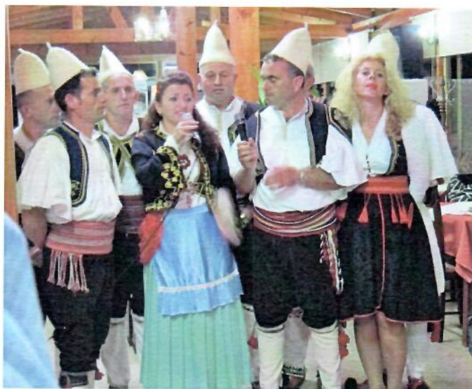
The Grupi Polifonik "Zeri i Bilbilit" from Saranda

At our next stop, Saranda, we had dinner in a local sea-side restaurant. After an excellent meal, the Ensemble Zeri i Bilbilit te Sarandes performed for us in beautiful local costumes. They were one of the highlights of the trip. Multi-talented, they first graced us with their mesmerizing polyphonic singing. Then they danced to an accompanying band. We came to discover the wonderful Albanian village type dances done almost everywhere we went, including pogonishte, kukesit, and katjushka (a pajdusko) and what was called valle treshe (or valle Napoloni). They also did tsorapia (or vallje e Cobanit) and the very ubiquitous tsiftatel. Each dancer had his or her own style and cute variations. I wish I could remember them all! Soon they were pulling us onto the floor and we danced many dances together. More singing, more dancing, other people at the restaurant joined in. I think every-