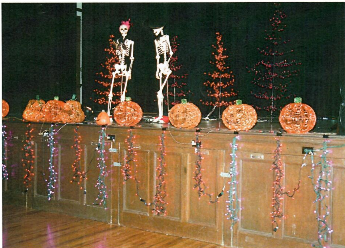
Halloween decorations at the Officer's Ball

THE MAGAZINE OF INTERNATIONAL FOLK DANCING 🍷 DECEMBER, 2013