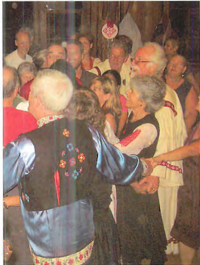
Mendocino Folklore Camp, photo by Susie.