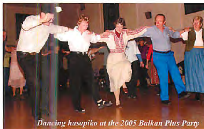
Dancing hasapiko at the 2005 Balkan Plus Party