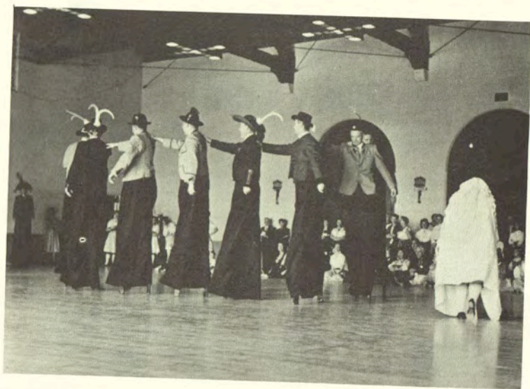
The Mountain Dancers of Los Angeles, performing at the Pasadena Festival January 24th. They say, "see you at Statewide".