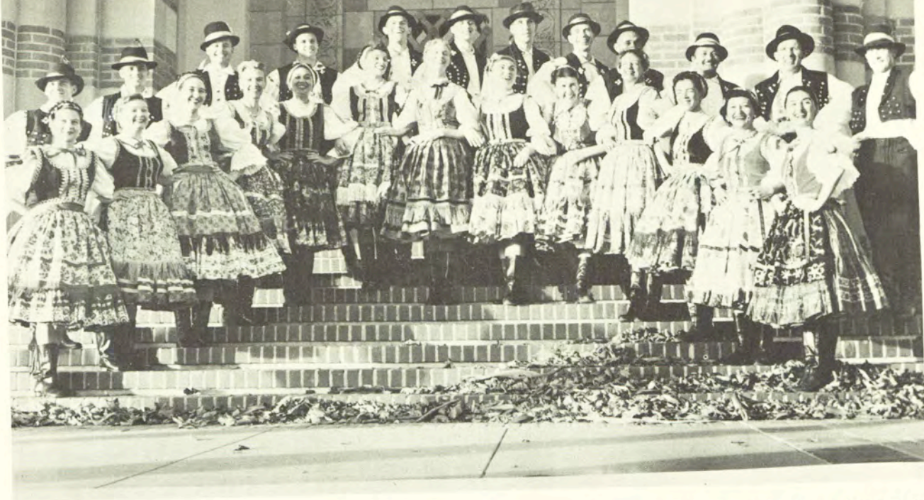
GANDY DANCERS of Los Angeles, pose on the steps of the UCLA Women's Gym following exhibition of "Red Boots" at the Santa Monica Festival, December 13, 1959. They'll be dancing "Red Boots" again at "STATEWIDE".