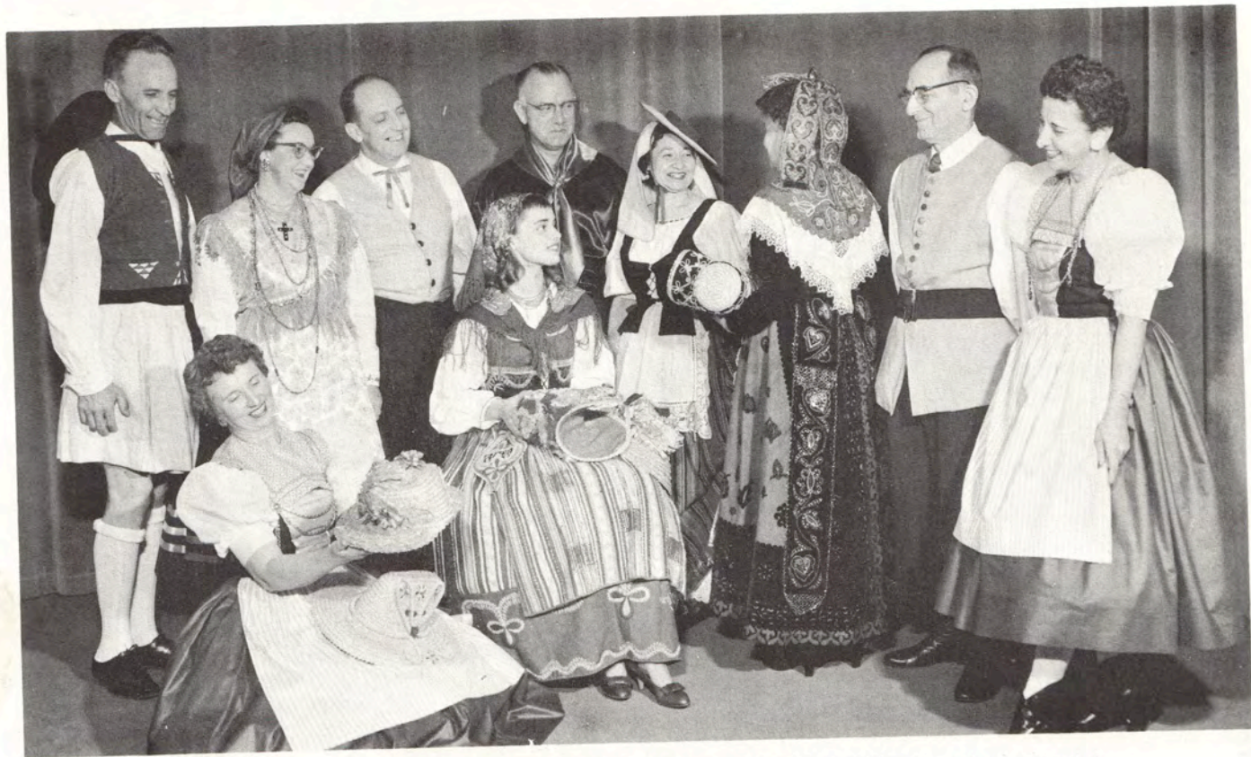
Members of San Leandro Folk Dancers in Costume (See Page 12)