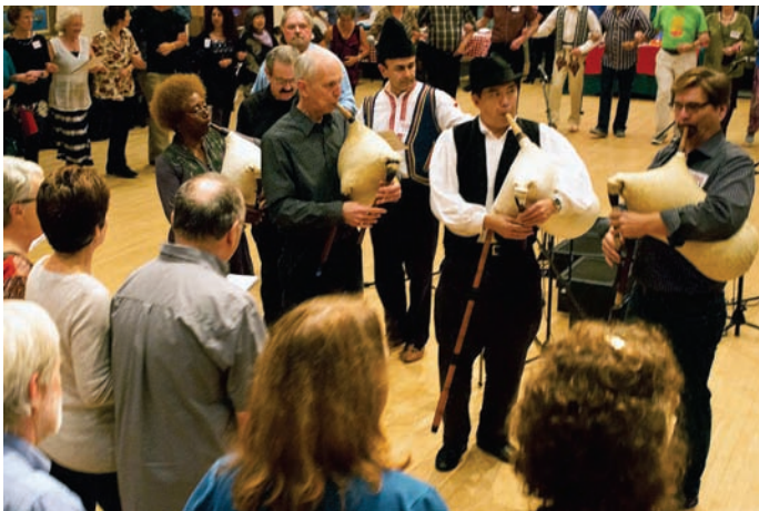
There were at least four gaidas at the Friday night jam session!

You're coming to see me at the Heritage Festival, aren't you?