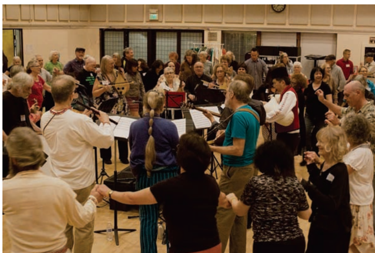
The crowd at the evening dance party with live music!