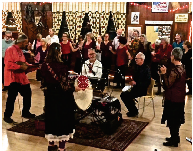
The crowd at the Razzmatazz Christmas party.