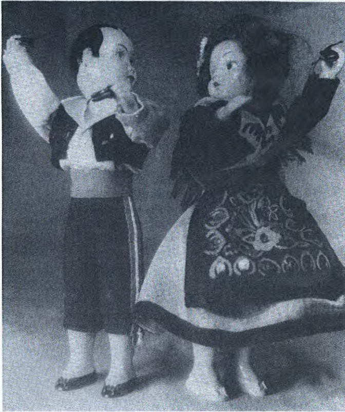
Folk dance dolls from the cover of the October, 1950 issue of Let's Dance! magazine. The dolls are the work of Emmy Albertazzi, of San Leandro.