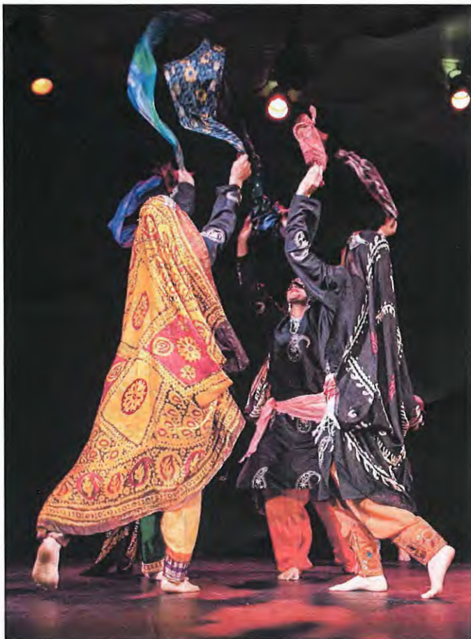
Bandari dancers