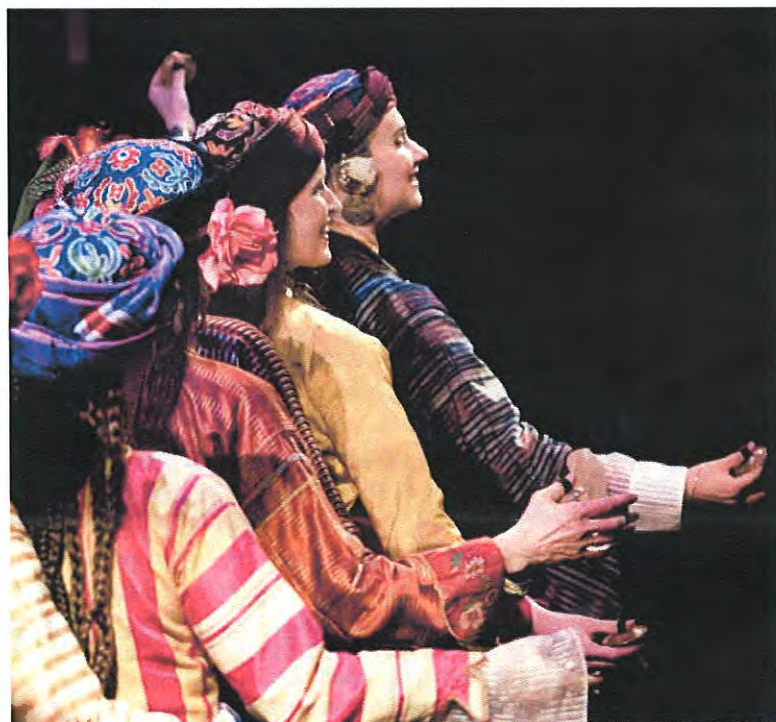
Ghawazi dancers, from the ANAR DANA Performance.

OFFICIAL PUBLICATION OF THE FOLK DANCE FEDERATION OF CALIFORNIA, INC.