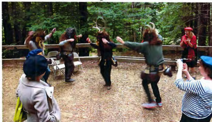
Bulgarian Kukerie, men dancing ritual fertility dances

Razzmatazz is like a gift I give to myself each year. It's a weekend of basking in the sheer joy of music and dance in a beautiful setting in the redwoods and, most of all, sharing in the energy and enthusiasm of the campers who come to Razzmatazz determined to have a good time! !