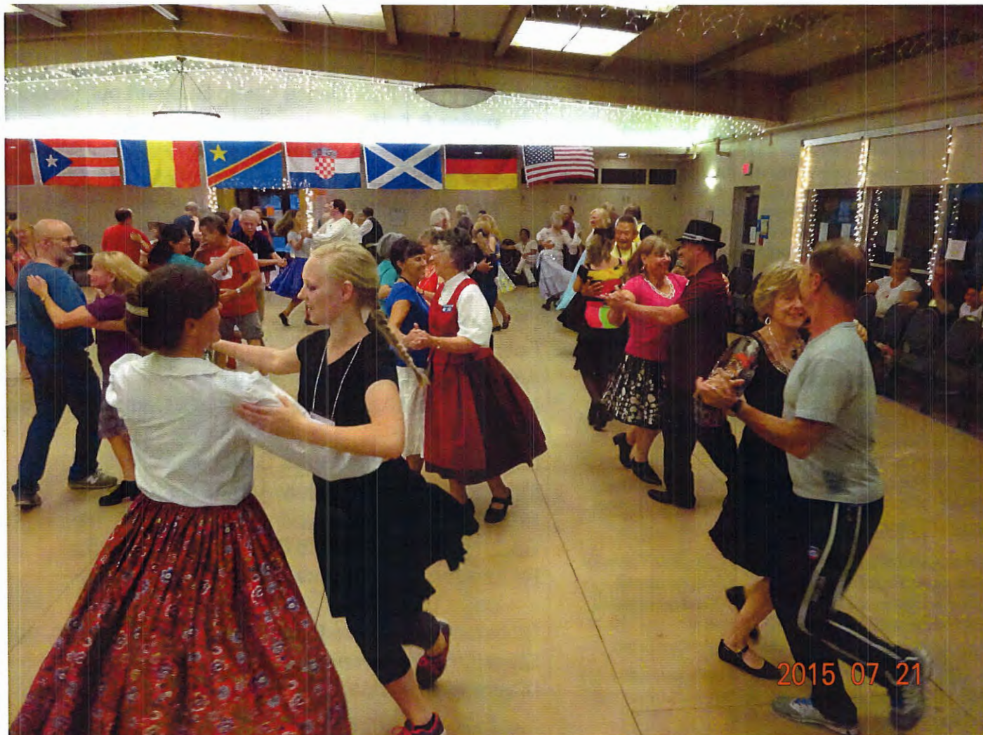
Opening night at Stockton Folk Dance Camp

THE MAGAZINE OF INTERNATIONAL FOLK DANCING & SEPTEMBER, 2015