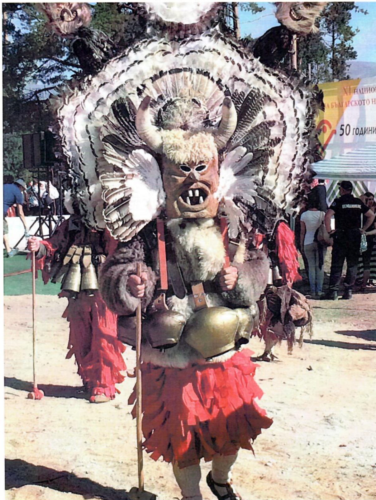
Kukeri - at the Koprivshitsa Festival

THE MAGAZINE OF INTERNATIONAL FOLK DANCING • NOVEMBER, 2015