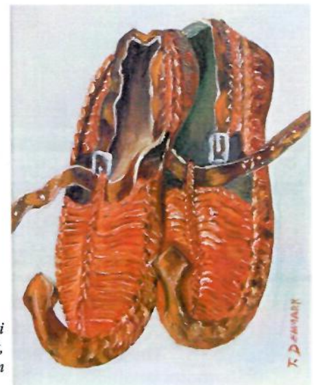
Serbian Opanci