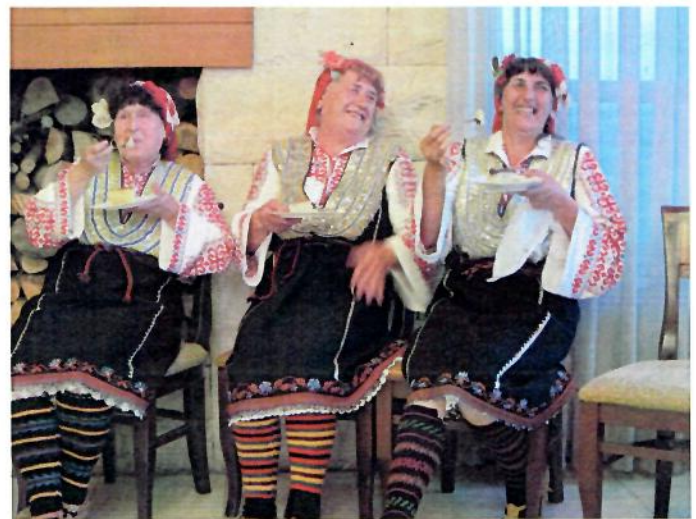
Bulgarian ladies enjoying a treat!