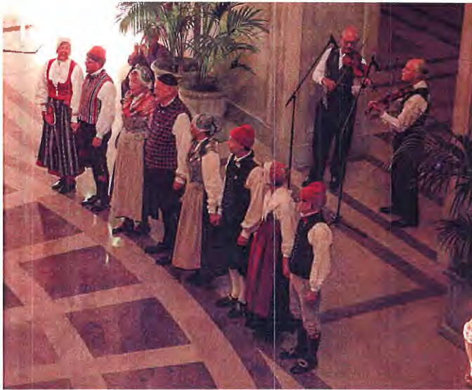
Swedish dancers in San Francisco