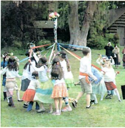
Maypole Dance in Golden Gate Park 2013