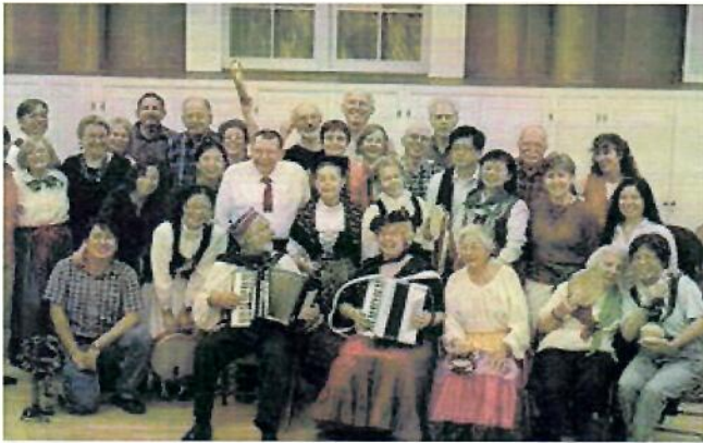
Italian Night with Vecernica 2008

It's our 75th birthday. Come party with us!