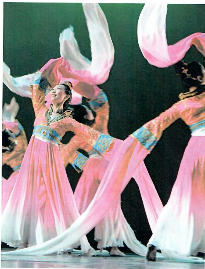
Chinese Performing Arts of America

The afternoon was a fun, free family event drawing not only from those with Silk Road country ancestries, but many from the local Mexican/American and Asian community. One older Vietnamese woman pointed to her high rise apartment building that overlooked the Plaza Gardens. "I live there," she pointed to the end apartment, "when I opened my window, I heard this wonderful music and came closer to see. Look how the many peoples all dance and play music together. This is how our community should always be!" (We all knew what this woman meant: Enjoying each other's diversity rather than the gang violence that has historically rocked her neighborhood.) The woman speaking had just purchased a pita wrap from Arabian Bites, who provided ethnic food choices for the