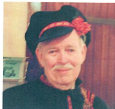
Your Editor

©Let's Dance! (ISSN#0024-1253) is published monthly by the Folk Dance Federation of California, Inc., with the exception of the May-June and July-August issues, which are released each two month period. Standard mail postage paid at Sacramento, California.