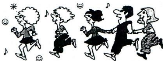
A photo from Balkanalia! 2013

We are planning a Scholarship Ball, called Midwinter Village Festival, on January 25, to be held at the IOOF hall in Placerville. Wear a folk costume! It is always a great time, on one of the most amazing dance floors you will ever experience. Plus you can spend the afternoon shopping at some very nice shops in the historic town of Placerville. Details to follow. —Barbara Malakoff