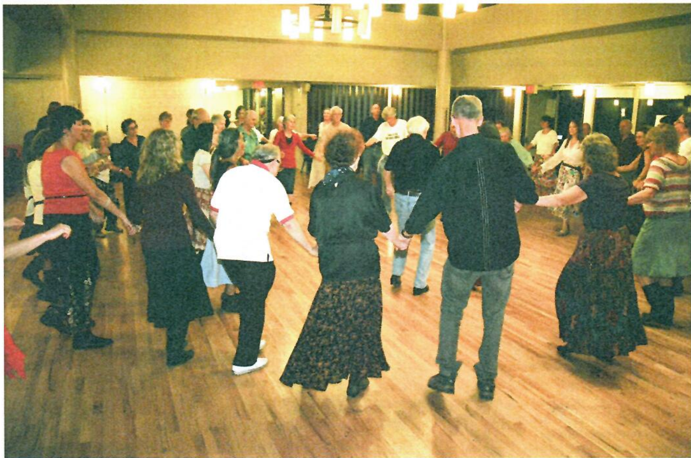
Balkan Plus! What a great crowd of wonderful dancers

THE MAGAZINE OF INTERNATIONAL FOLK DANCING ☛ NOVEMBER, 2013