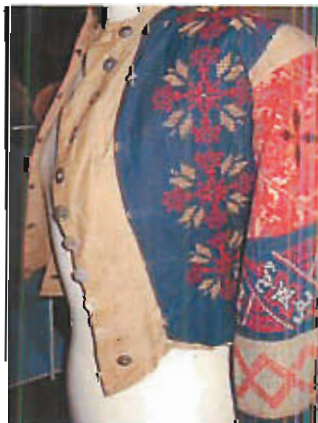
photo at right), and both had been made by a professional tailor. "What we have here," sez I, "is an urban costume."

In September 2009 the theme reappeared: a three-piece ensemble described as "Antique 19th-century three-piece dress/costume loaded with folk embroidery and fine intricate lace." The plain red skirt matched nothing else in the set in terms of material, hue or adornment, and seemed to be a replacement for the original. But the apron matched the fitted blouse (see