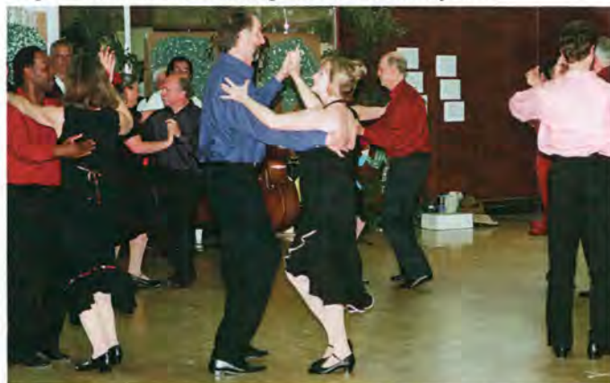
Salsa Dancing with the Jubilee American Dance Theater