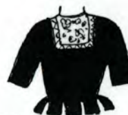
DETAIL OF BODICE BACK