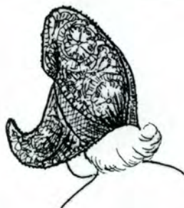
DETAIL OF CAP