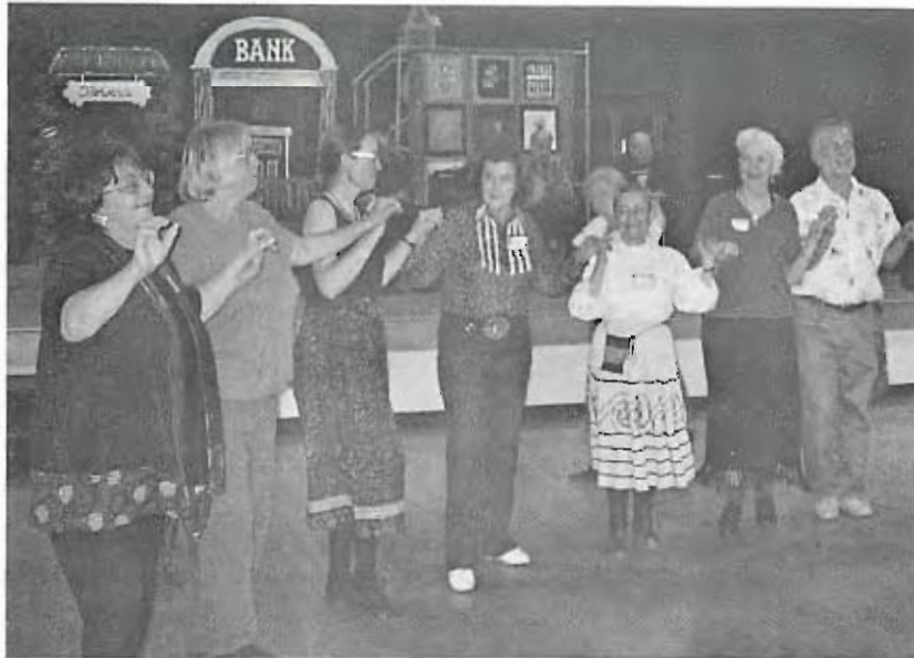
Fresno Fall Harvest Festival fun! Article on page 13