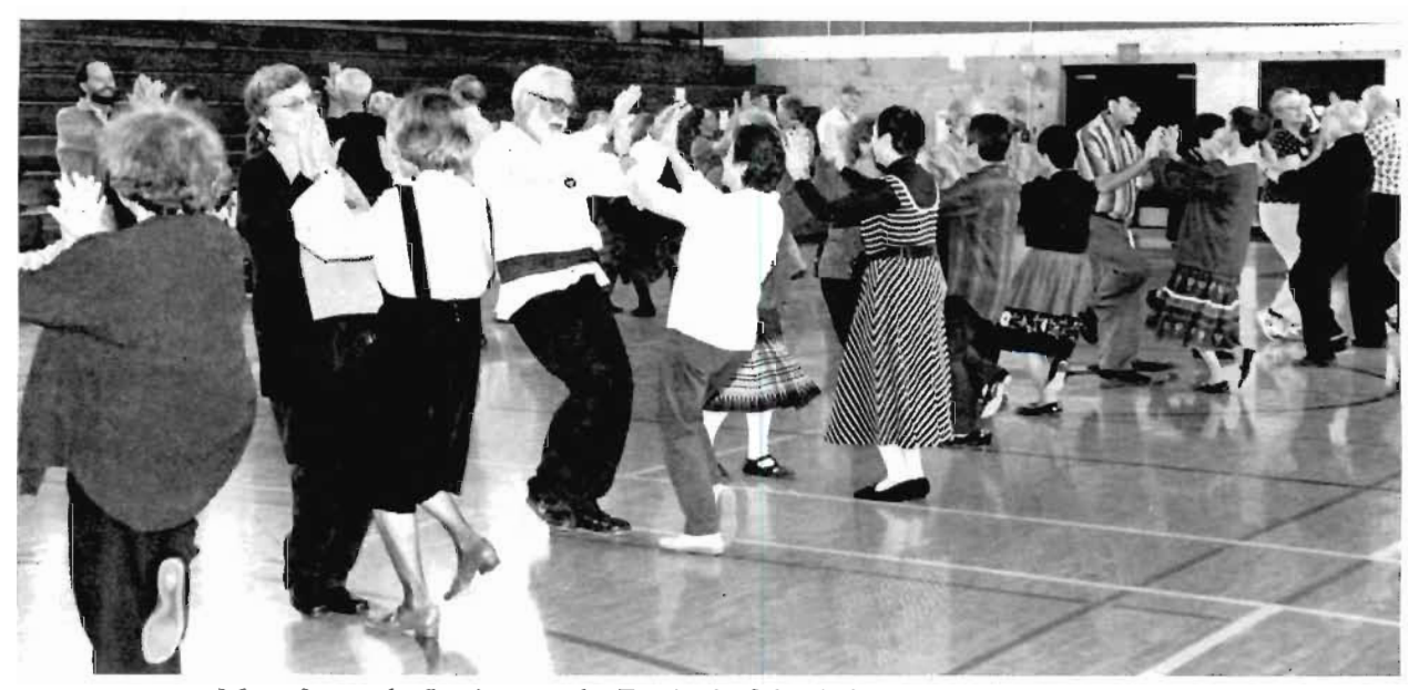
More fun at the Institute at the Festival of the Oaks, dancing Debka Lahat