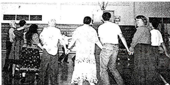
GENERAL FOLK DANCING