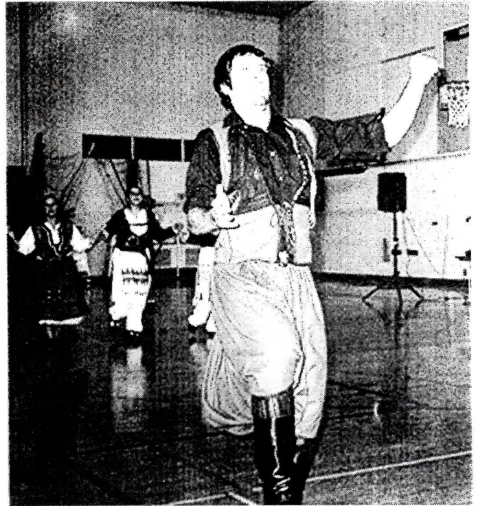
KAMARI GREEK DANCERS