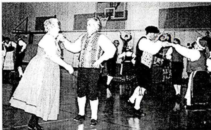
FRESNO DANISH DANCERS