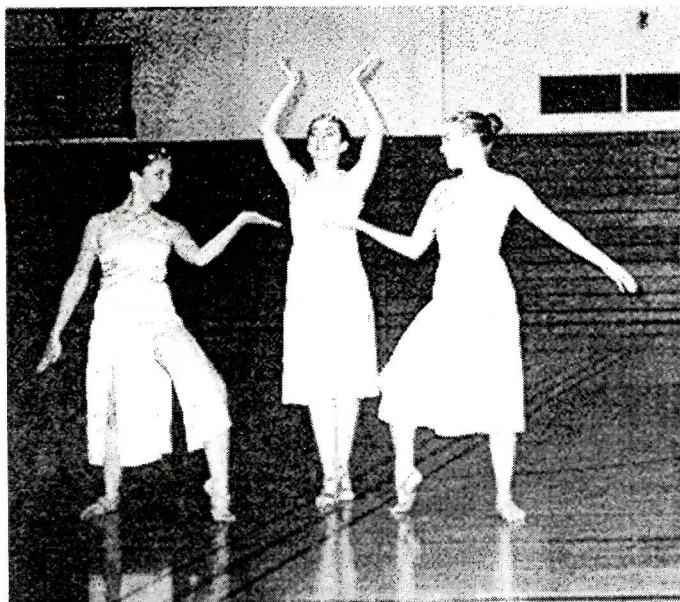
G.G. BALLET DANCE STUDIO