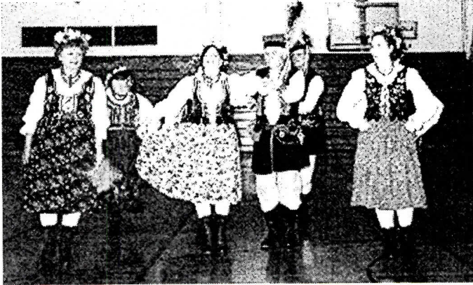
POLASKI POLISH DANCERS