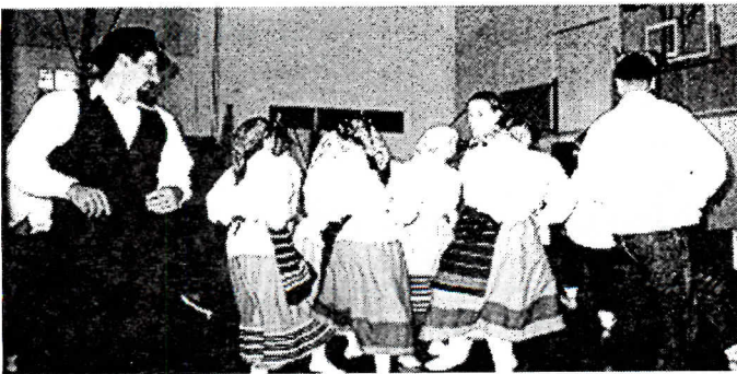
SAUDADE DO BRAVO PORTUGUESE DANCERS