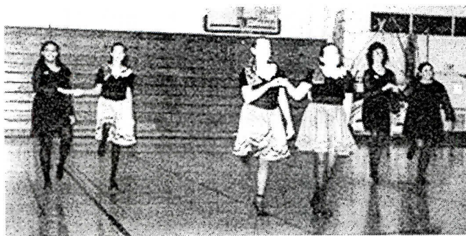
McTEGGERT IRISH DANCERS