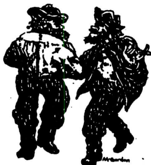
A California Miner's Dance.

Where is Rocklin? and Where do we dance?