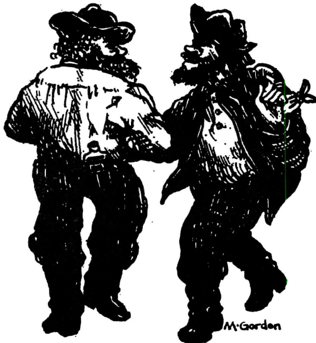
A California Miner's Dance.

Save this date for fun and frolic in the historic California Gold Country!