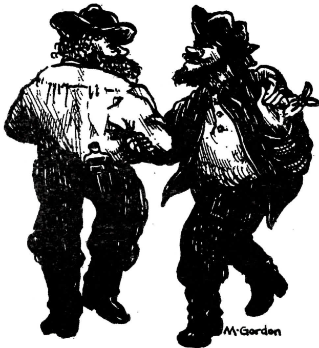
A California Miner's Dance.

Save this date for fun and frolic in the historic California Gold Country!