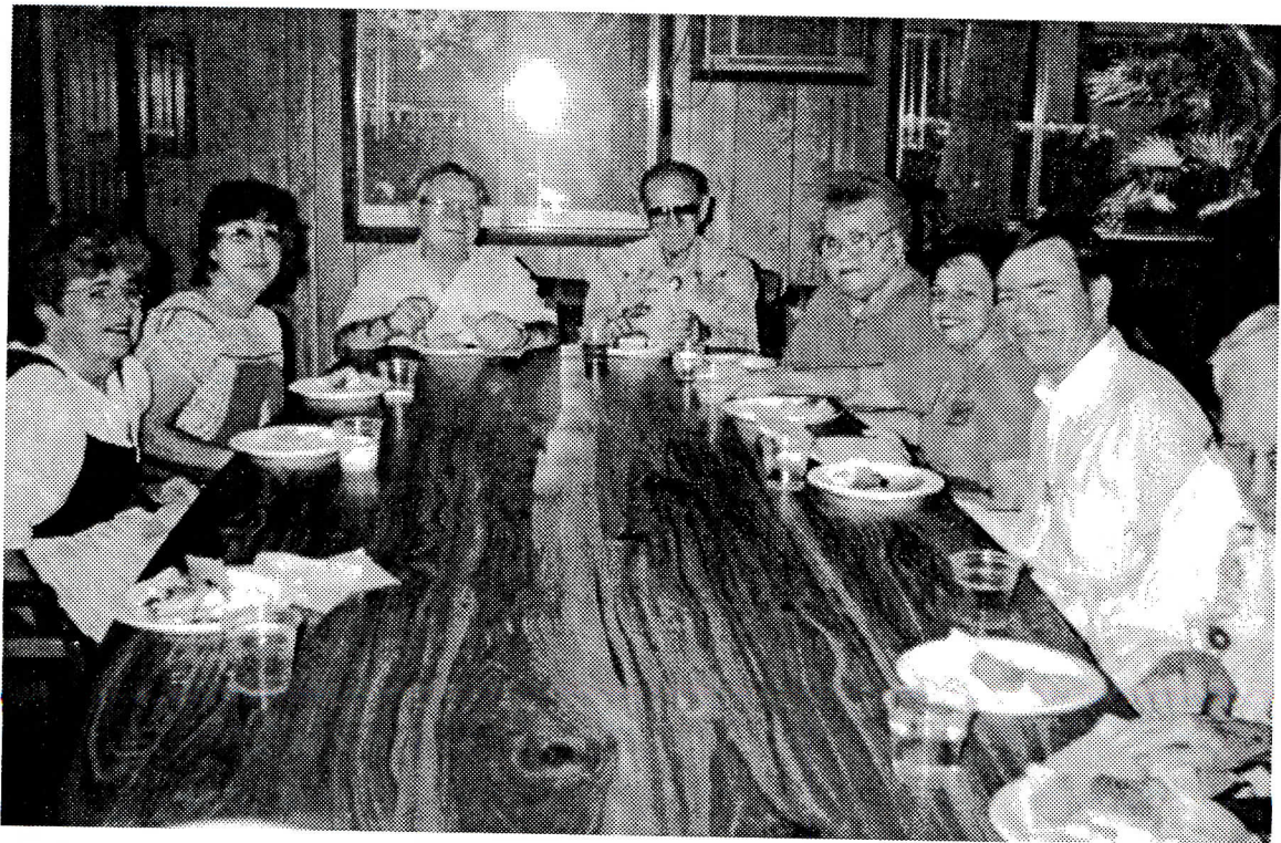
Federation Past-Presidents party.