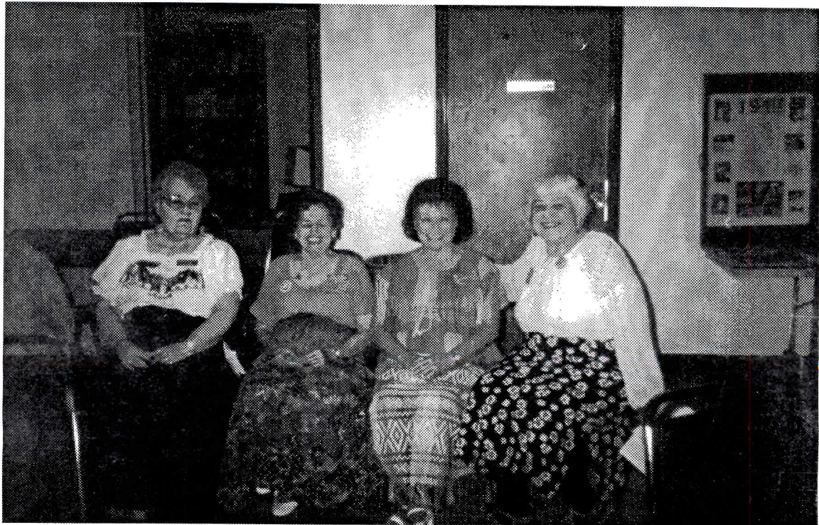
"Ladies Time Out."