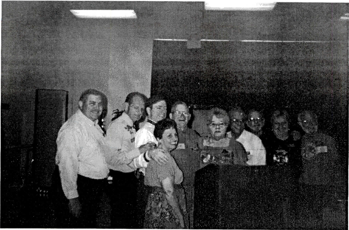
Newly-installed Federation North officers.