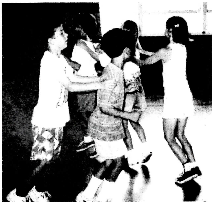
Children dancing the bunny hop during summer school at Proctor Terrace School in Santa Rosa.