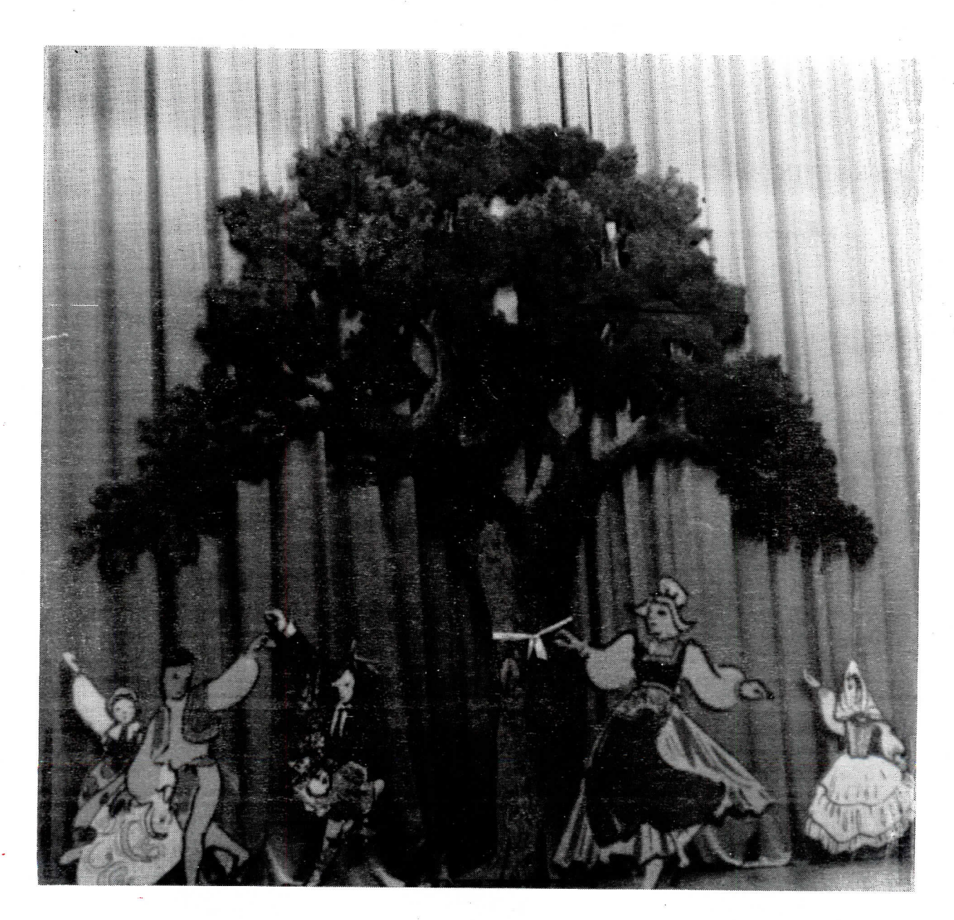
Welcome to the Festival of the Oaks