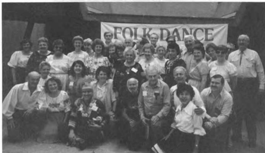
Members of the Federation from Northern California gather for a group picture while attending Statewide '87 in Pasadena, CA.