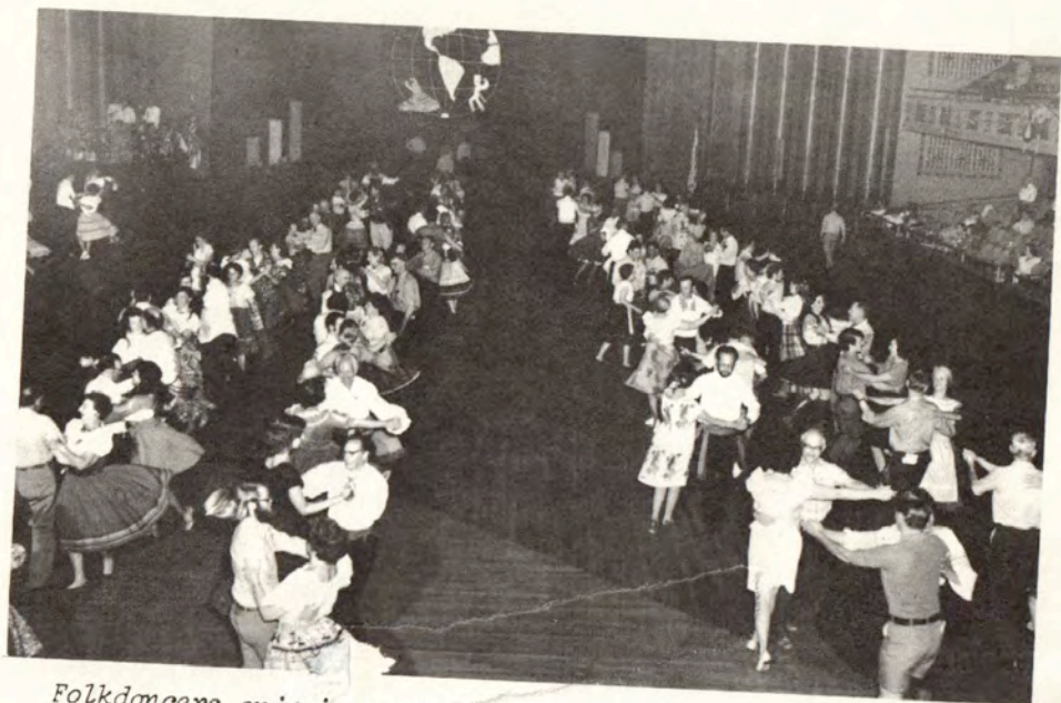
Folkdancers enjoying a Contra called by Bev Wilder at 1972 STATEWIDE in Sacramento.