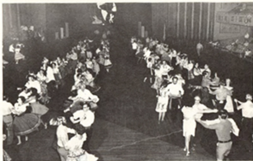
Folkdancers enjoying a Contra called by Bev Wilder at 1972 STATEWIDE in Sacramento.