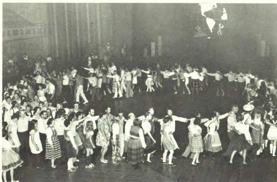
Folkdancers enjoying Doudlebska Polka at STATEWIDE 1972 Festival in Sacramento