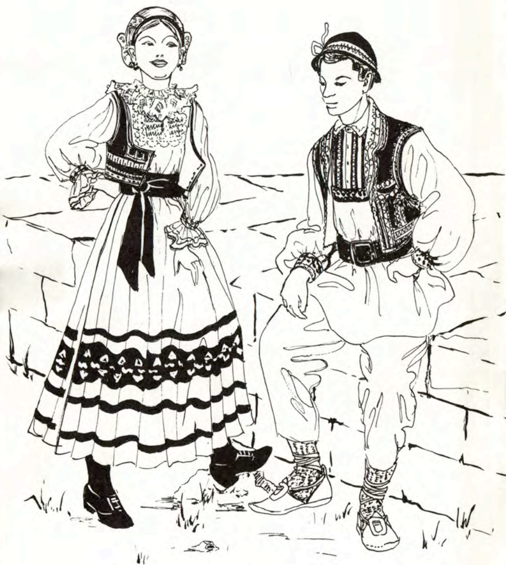
(Plate 1) Sketched by Audrey Fifiield