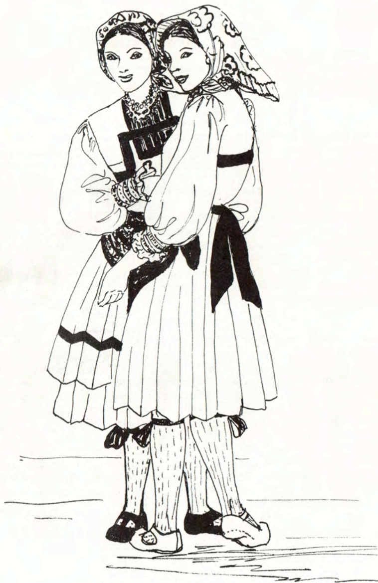
(Plate 2) Sketched by Audrey Fifield