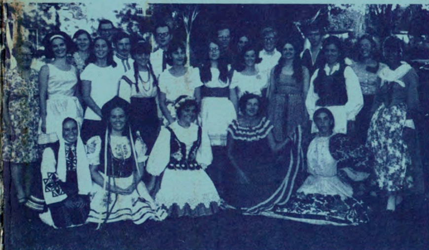
STOCKTON FOLK DANCE CAMP 1970 SCHOLARSHIP WINNERS