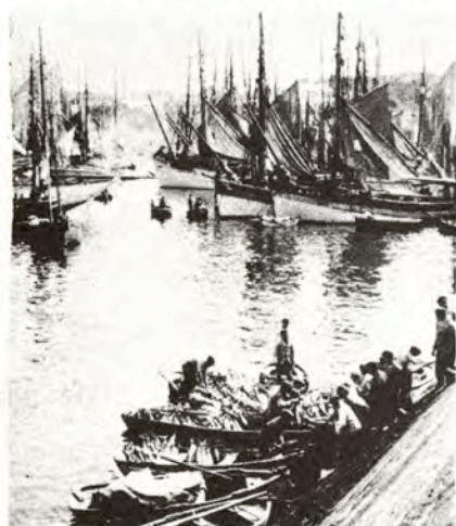
Fishing fleet, Concarneau

The region is divided into two sharply contrasting parts - the coast line and the inland plains, which, since the last century, have provided the province with agricultural wealth. The coast line is strongly indented, and the many estuaries that have been formed provide shelter for important ports. Many bases of the French Navy are found along the coast of Brittany.