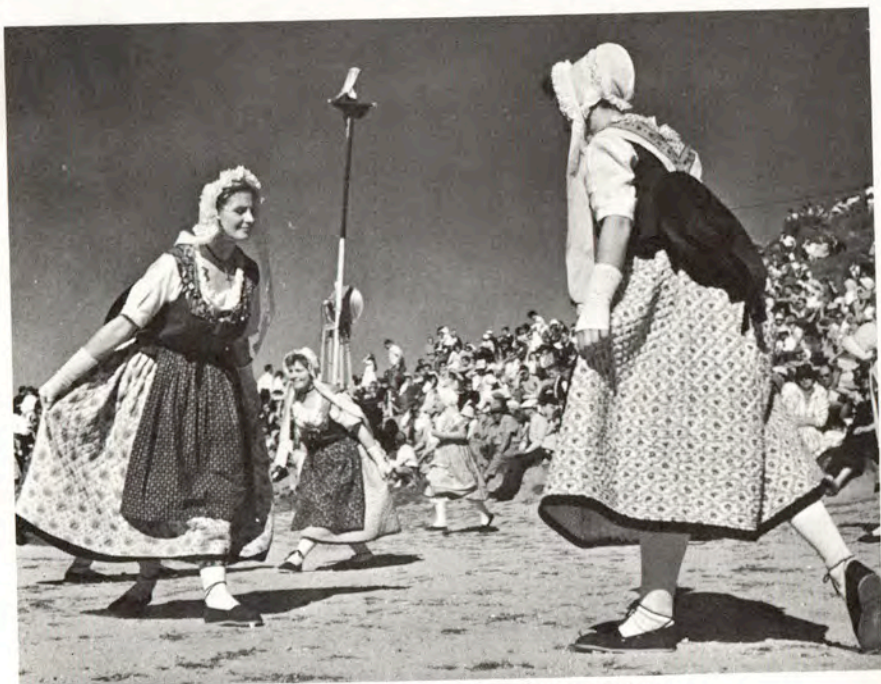
Folk Dancers of Provence

May appears to be the most exciting month for festivals, including the Music and Dance Festival at Bordeaux ; Folklore Festival at Wissembourg , and the Fest-