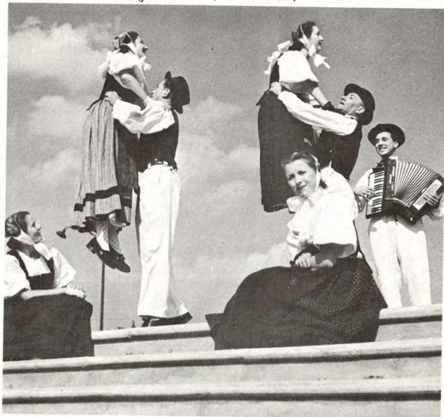
Folk Dancers of Savoie at Open Air Theatre

ival of Jurade , at which time wine is sold, at St. Emilion .