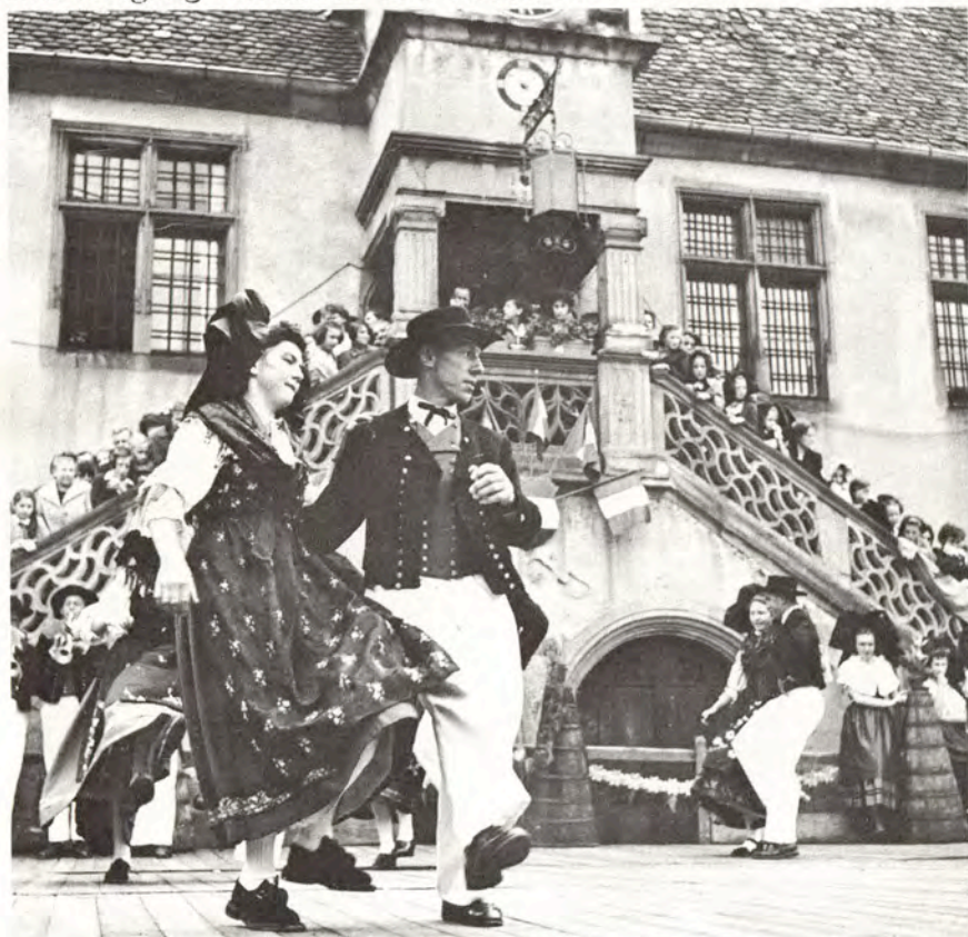
Folk Dancers of Alsace

The French people love a good time, and make the most of an opportunity to enjoy their music, dancing and singing whenever the occasion arises.