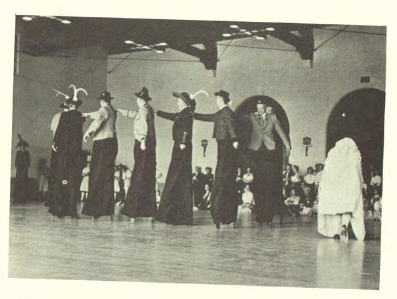
The Mountain Dancers of Los Angeles, performing at the Pasadena Festival January 24th. They say, "see you at Statewide".