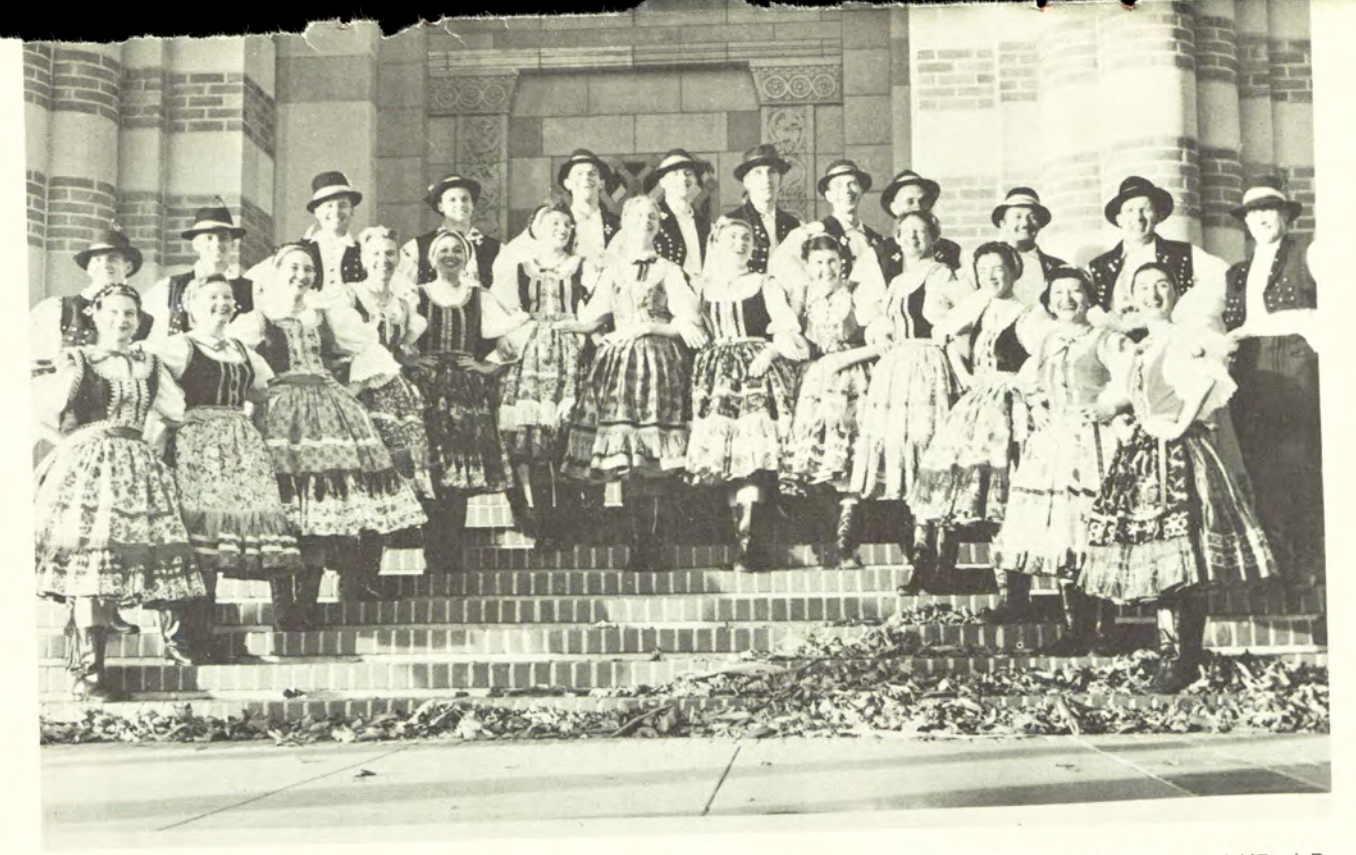
GANDY DANCERS of Los Angeles, pose on the steps of the UCLA Women's Gym following exhibition of "Red Boots" at the Santa Monica Festival, December 13, 1959. They'll be dancing "Red Boots" again at "STATEWIDE".