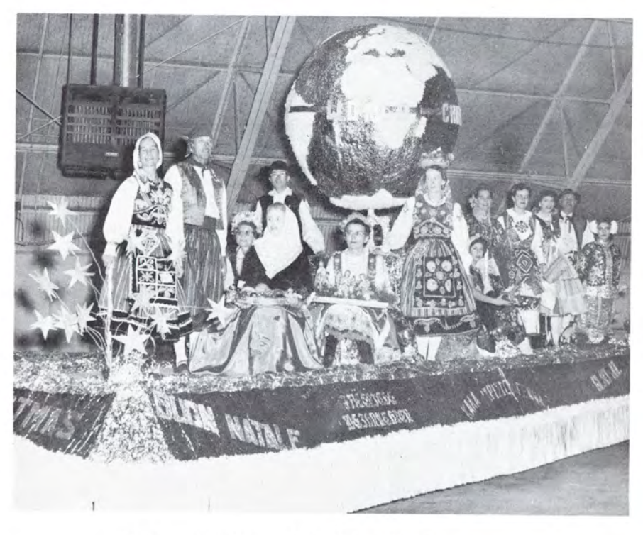
"Christmas Around The World" Float