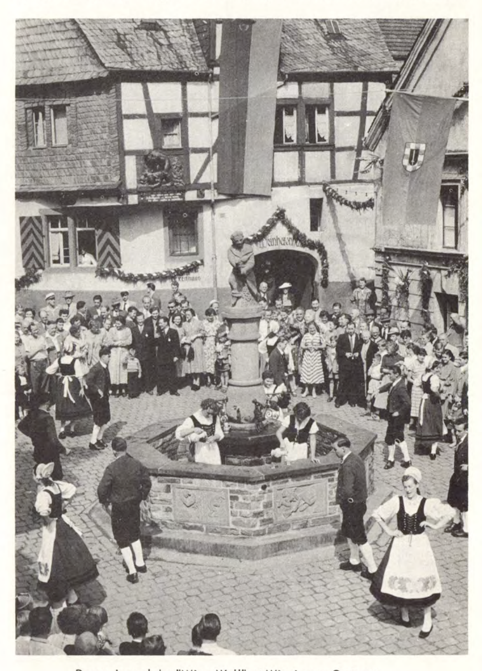
Dance Around the "Wine-Well" at Winningen, Germany

never forget that long ago Kroev was honored by nobility. Even their homes still carry the pride and dignity of that time. Lovely timbered