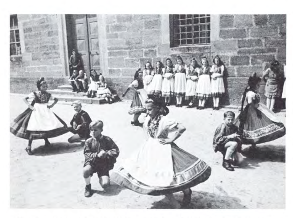
Children from Schwalm Folk Dancing