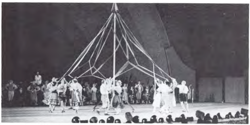
The Mountain Dancers Perform the "Gaisberger Banoltanz" on Family Night at the Hollywood Bowl, August 1958

Due to our high percentage of scientists it goes without saying that others of our membership are working on projects which are yet to become reality, so some day in the future, as you are seated in front of your TV set watching the first manned rocket ship land on the moon from the U.S.A., and you see one of the earthlings grab a moon-maiden and break into a step that looks familiar - don't be alarmed - it's just a Mountain Dancer teaching her to Hambo!