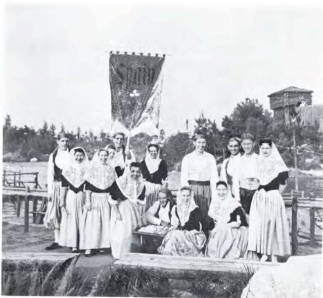
"HOOLYEH DANCERS" of Long Beach