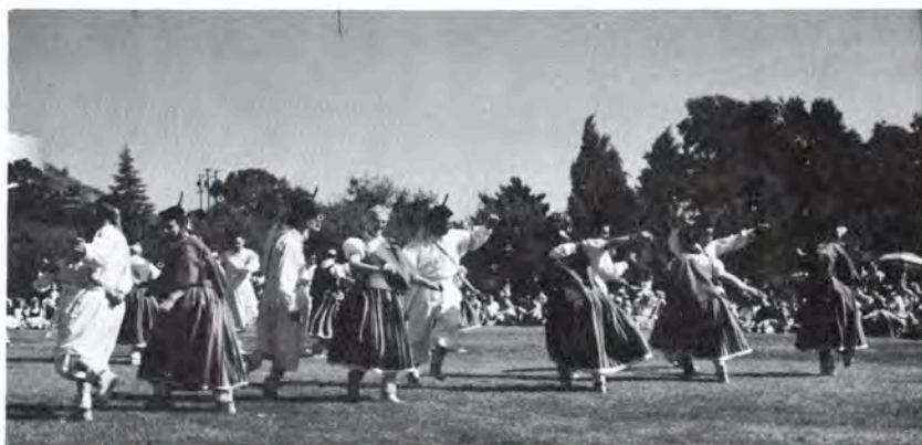
CASTANETS OF SACRAMENTO Baile de Camache - Portuguese Dance