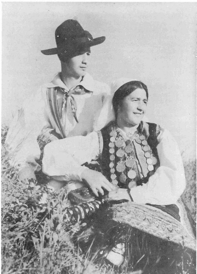
Young Couple of Slovenia