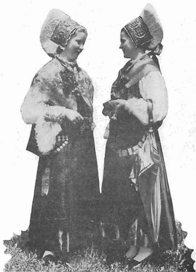
Two Slovenian Beauties

Slovenia's mountains have endowed her inhabitants with a characteristic walking gait which is reflected in their dances. The mountaineer shifts his body weight from one leg to another in a peculiar rhythm and with a synchronous circular movement of the arms.