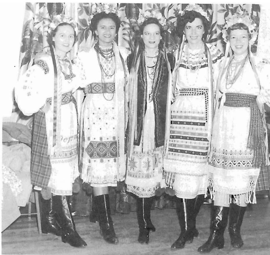
Five Southern California "Beauties"