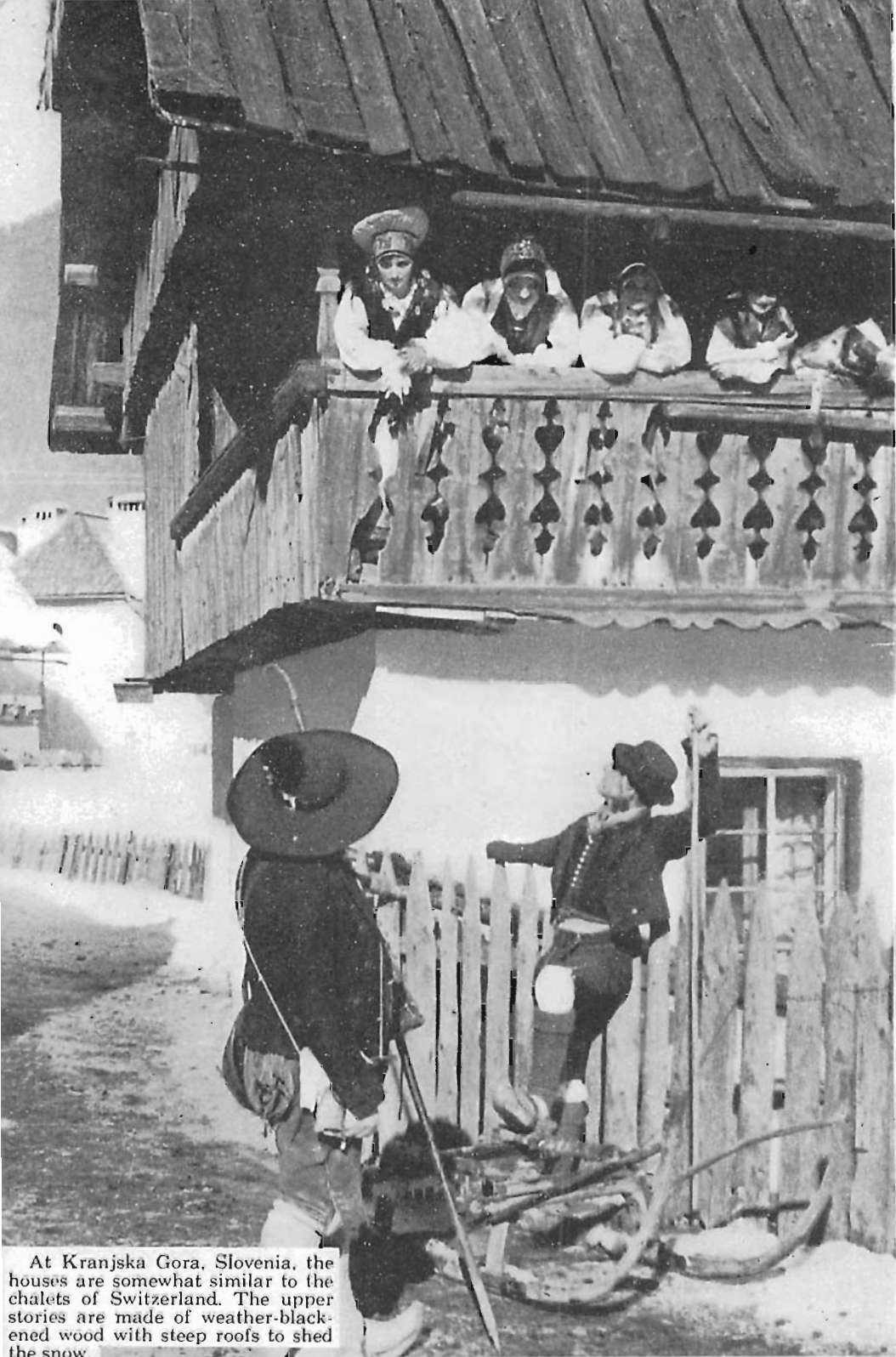
At Kranjska Gora, Slovenia, the houses are somewhat similar to the chalets of Switzerland. The upper stories are made of weather-blackened wood with steep roofs to shed the snow.