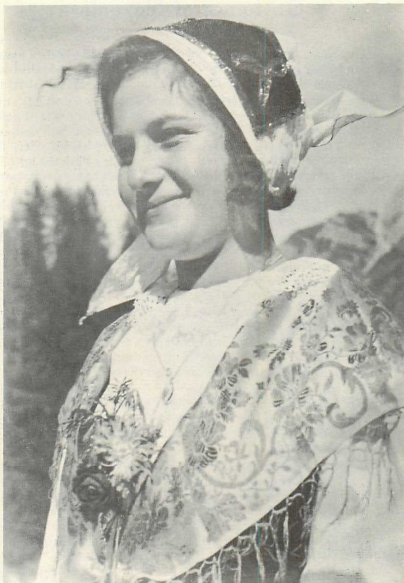
Costume of Slovenia