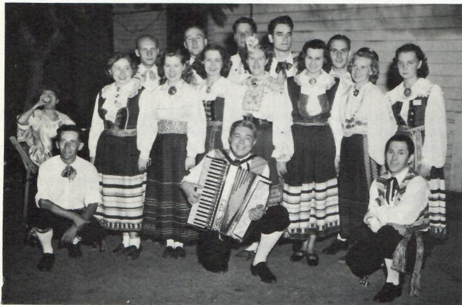
Estonian Dancers, International Day Festival, Los Angeles.