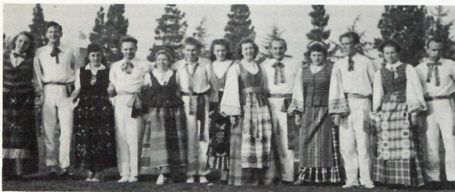
A line-up of Lithuanians, at the Pomona Festival.