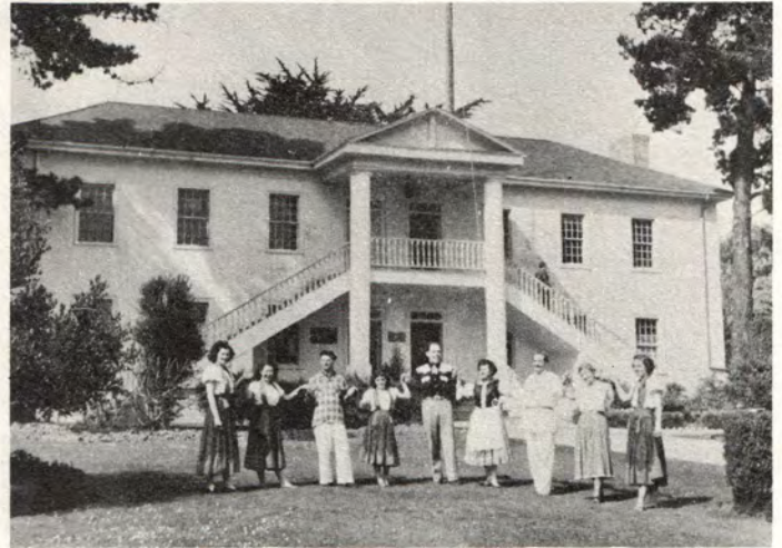
Two choice dancing spots at the Folk Dance Fiesta of 1950—under the Cypress at Lover's Point and at Monterey's famous Colton Hall.