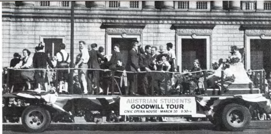
San Francisco marked high point of tour. Here students board truck for participation in St. Patrick's Day Parade. After parade they gave exhibition in Golden Gate Park with Municipal Band.