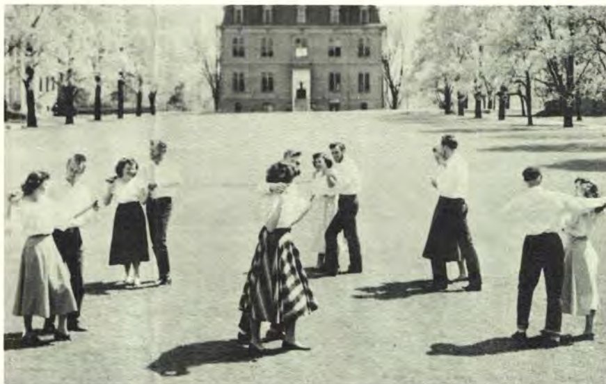
Students of the University of Nevada rehearsing for the recent State Festival.